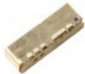
2050 / 2250 MHz Ceramic Duplexer